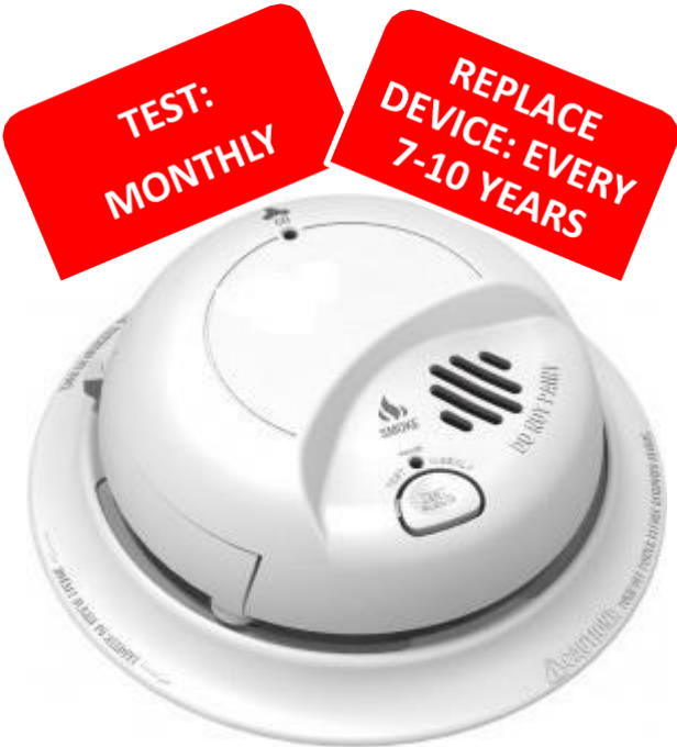
Above frequencies may vary depending on device manufacturer.

FDNY Bureau of Fire Prevention www.nyc.gov/fdny