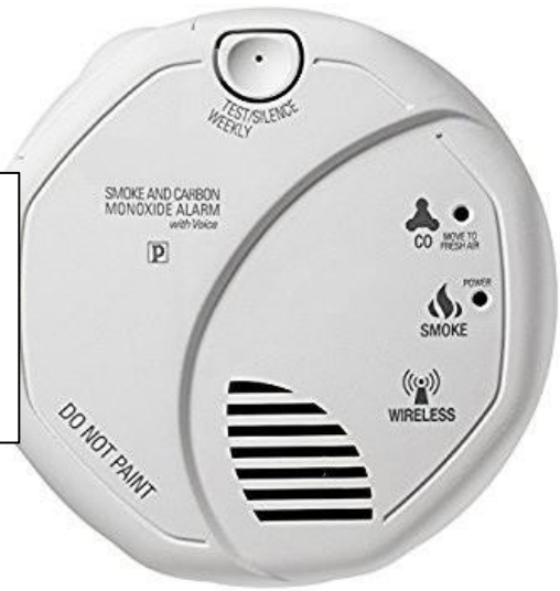
EXAMPLE OF A TYPICAL SMOKE AND CARBON MONOXIDE ALARM.

Hardwired smoke and carbon monoxide alarms are wired into your home's electrical grid. Typically these alarms have a back-up battery if power is lost.