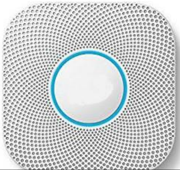
EXAMPLE OF A SMART DEVICE.

Smart smoke and carbon monoxide alarms are also available. The difference between smart alarms and conventional alarms is that smart alarms do their own diagnostics to make sure they're working properly and sync with home automation apps so you can monitor your home from afar.